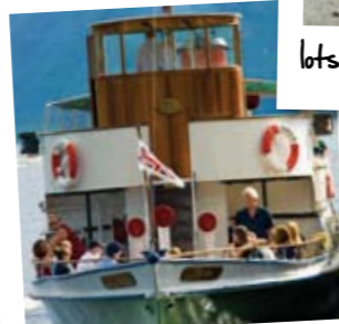
a "steamer" on ullswater

This though is just an illusion and Place Fell is perfect for families with a desire for adventure!