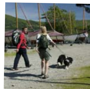
lots of sail boats at ullswater