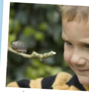
make new friends!