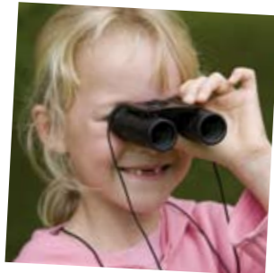
see for miles!