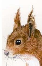
Tufts of hair