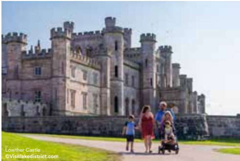
Lowther Castle