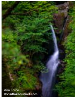
Aira Force